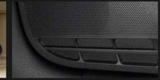
1) For mobile phones with Bluetooth interface with hands-free profile 1.5 and remote SIM Access Profile 1.0 (rSAP). Mobile phones are connected to the external vehicle aerial via rSAP to www.volkswagen-zubehoer.de for further details. 2) Not for "RCD 210" radio. 3) Will be introduced at a later date.

The "Volkswagen Sound" system 2), 3) delivers full, precise sound with a total output of 400 watts. Eight high-performance loudspeakers with powerful amplifiers and subwoofers assure your listening pleasure. High-grade materials like the fibre glass reinforced membranes underline the high quality of the Volkswagen Sound system. | SO